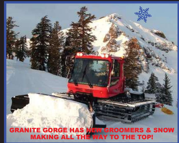
GRANITE GORGE HAS NEW GROOMERS & SNOW MAKING ALL THE WAY TO THE TOP!